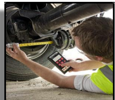
Full Function Remote Control

One Tool, One Person, One Process. LITE CHECK.