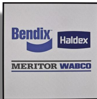
Trailer ABS Solutions